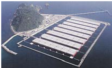
Oil Stockpiling Facility