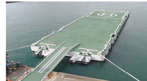
Stockpiling for Emergency