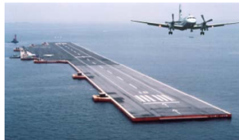
Airport Demonstration Model