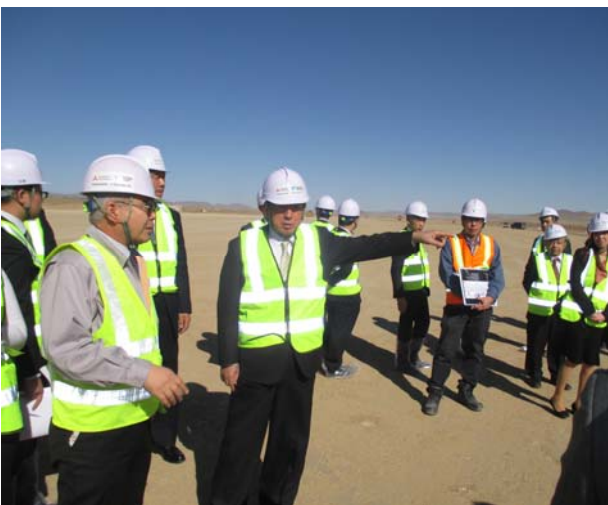
Site Visit of New Ulaanbaatar International Airport