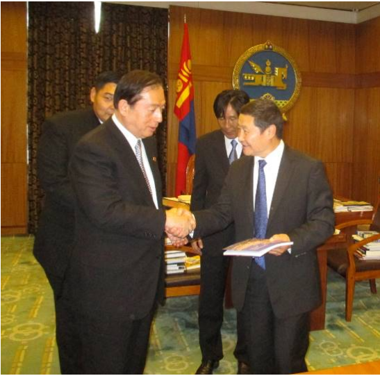
Meeting with Prime Minister Altankhuyag