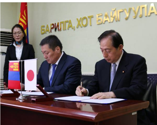
Signing ceremony of a Memorandum of Cooperation in the Field of Infrastructure between MLIT and The Ministry of Construction and Urban Development of Mongolia