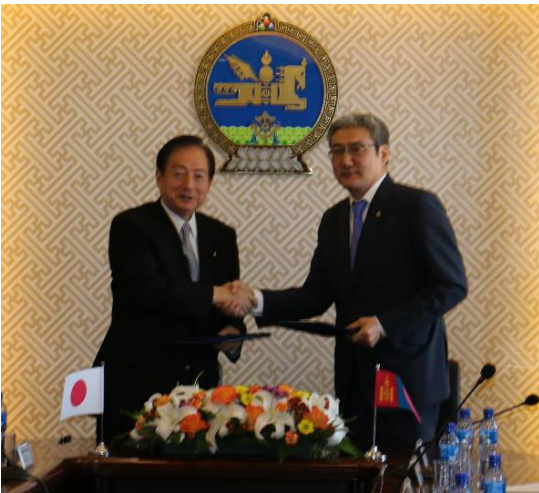
Signing ceremony of a Memorandum of Cooperation in the Field of Infrastructure between MLIT and The Ministry of Roads and Transportation of Mongolia