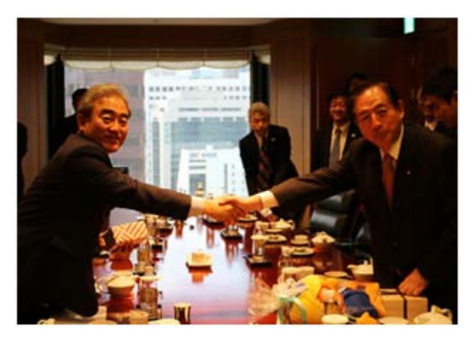
Meeting with Dr.Yoo Jinryong Minister of Culture, Sports and Tourism