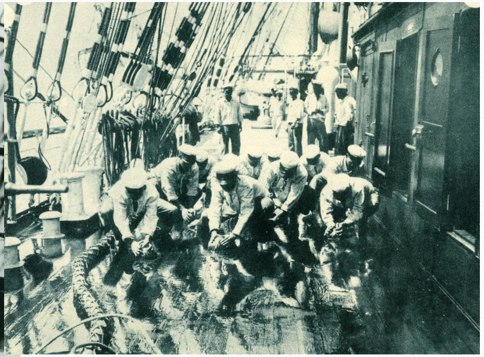
Scrubbing the deck