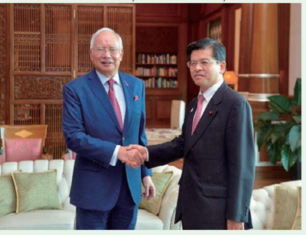
Discussions with Malaysia Prime Minister Najib Razak

In December 2017, Minister Ishii engaged in discussions about infrastructure and transportation sector policy with key persons from the Sri Lankan and Indian governments. The officials exchanged opinions about cooperation with Sri Lanka in the fields of water- and sediment-related disasters, the need for sewage system improvement triggered by