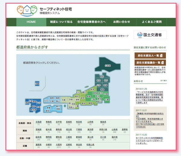
website (in Japanese) called "Safety Net Housing"

There is a website (in Japanese) called "Safety Net Housing" where you can search for rental housing that accepts foreigners: http://www.safetynet-jutaku.jp/guest/index.php