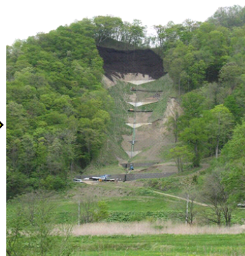
Recovering vegetation by hillside work to stabilize slope