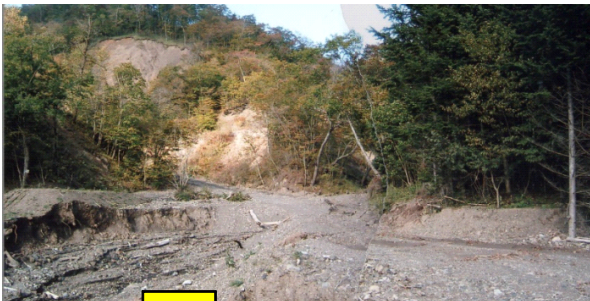
Devastated mountain stream