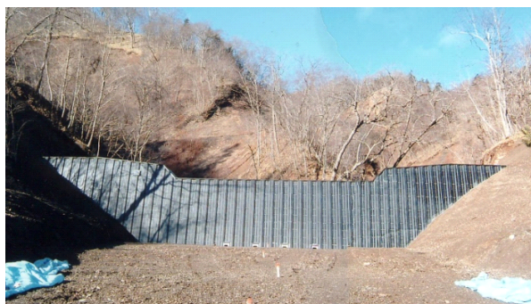
Stabilizing mountain stream and preventing erosion by stream works