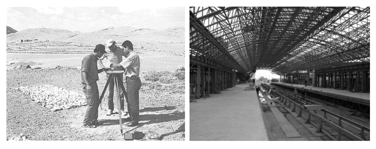
127. (Construction site of Philippines' No. 2 Elevated Railroad)