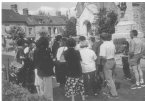
Overseas study tour

In order to gain an competitive edge, businesses often take advantage of human resources from outside or those who have learned about technologies, products or services of other businesses or industries through training programs or other means.