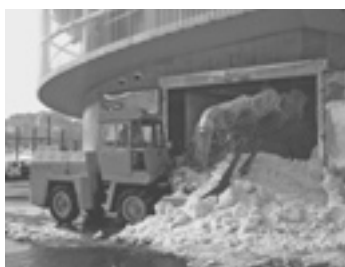
Putting snow into a snow storage

The “discovery” of these local resources has been made possible by a number of factors: (i) deeper understanding of