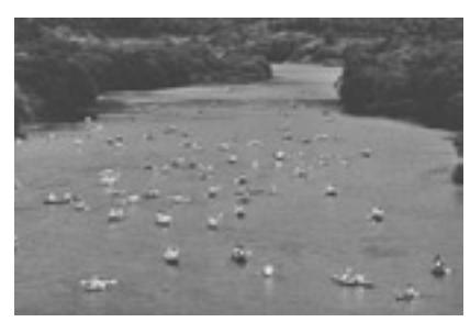
People enjoying canoe touring