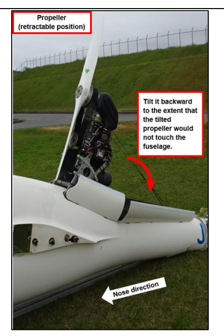
Figure 2: Appearance of the extended engine

When the pilot tried to retract the engine and the propeller, he could not retract them into the fuselage because the propeller did not move to the retractable position. In order to reduce drag, the pilot tilted the engine backward by using the manual extension/retraction switch to the extent that the propeller would not touch the fuselage and retracted the main landing gear located in the lower fuselage by using the main landing gear handle.