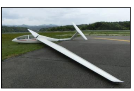
Figure 4: Accident site

Besides, there was no leakage of oil and fuel, but coolant leaked out through the radiator line, accumulating in the bottom of the engine compartment. (3) Maintenance of the Aircraft