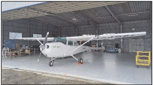
JAPAN AIR COMMUTER

According to the statements of the pilot of Cessna 172P (hereinafter referred to as "Trainee A"), JA4061 (hereinafter referred to as "Aircraft A"), operated by New Japan Aviation Co., Ltd., (hereinafter referred to as "the Company"), the captain who was the flight instructor of Trainee A (hereinafter referred to as "Captain A"), the previous flight instructor of Trainee A (hereinafter referred to as "Previous Instructor A"), the captain of ATR 42-500 (hereinafter referred to as "Captain B"), JA04JC (hereinafter referred to as "Aircraft B"), and its first officer (FO) (hereinafter referred to as "the FO B"), the air traffic controller who was in charge of the tower control position of the Kagoshima Airport Traffic Control Tower when the serious incident occurred (hereinafter referred to as "Tower C"), and the air traffic controller who was in charge of the tower control position of the Airport Traffic Control Tower before being relieved by Tower C (hereinafter referred to as "Tower D"), as well as voice recordings on IC recorder in Aircraft A, records on Aircraft B's flight data recorder, ATC communication records, radar track records, and video recording of surveillance camera installed in the hanger of the Company, the history of the serious incident is summarized as follows.