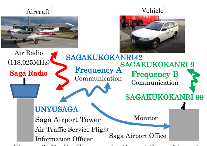
Figure 2: Radio Communication at Saga Airport

Air radio "Saga Radio" and "UNYU SAGA" used by the Air Traffic Service Flight Information Officer were recorded. Frequency B was not recorded. The voice of the vehicle sent to the airport office was recorded in the frequency A record.