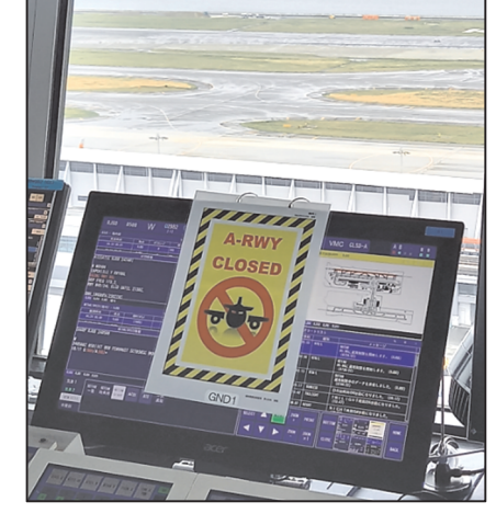
Figure 5: Example of How the Reminder is used (When a runway is closed)

The Operation Processing Procedures established by the Airport Traffic Control Tower stipulates that in case where the runway is not available for take-off and landing of aircraft due to closure of the runway and others, the tower control position and ground control position shall cover the display screen of the anemometer with a special reminder and surely grasp the situation of runway and its surroundings in order to perform ATC services.