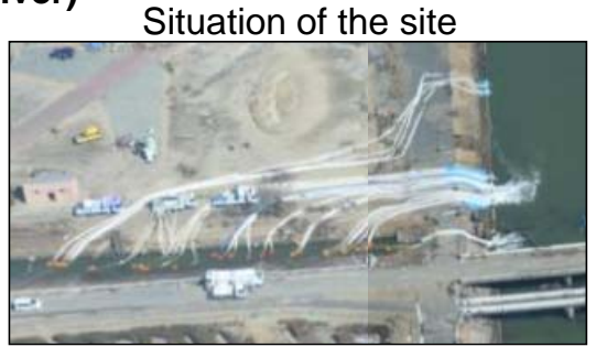
Pump trucks in operation (60m 3 /min., 40m 3 /min., 30m 3 /min.)