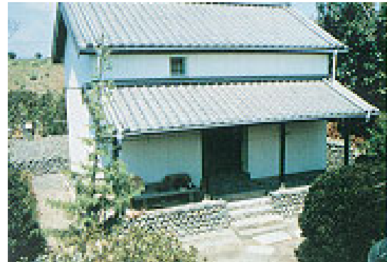
Mizuya; as shown, the masonry walls on the upstream side and at the rear of the house are high.