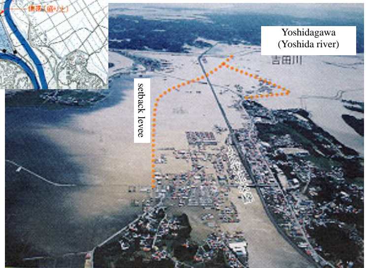
The area affected by the 1986 flood and the locations of the setback levees