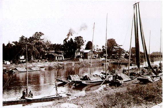
Kakumagawa port, one of the busiest river ports in the days of water transportation (ca. 1907)