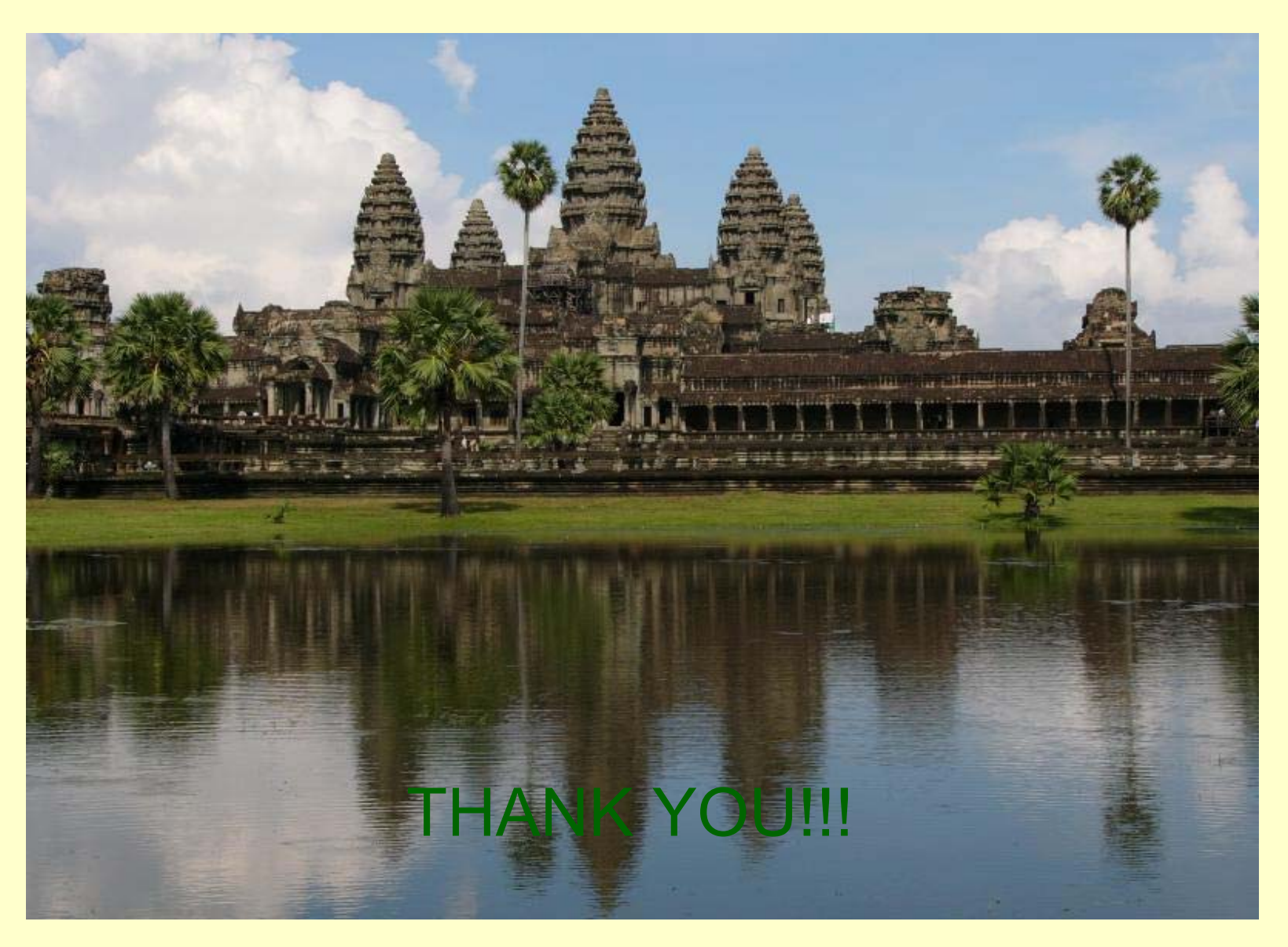
Cambodia Paper for MEET-FUM, 17-18 Jun. 09, Hokkaido, Japan