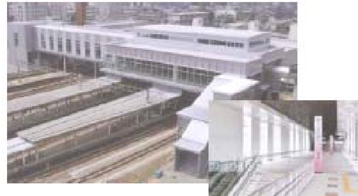
North-south Corridor and Station on Bridge (Completed in August 2011)