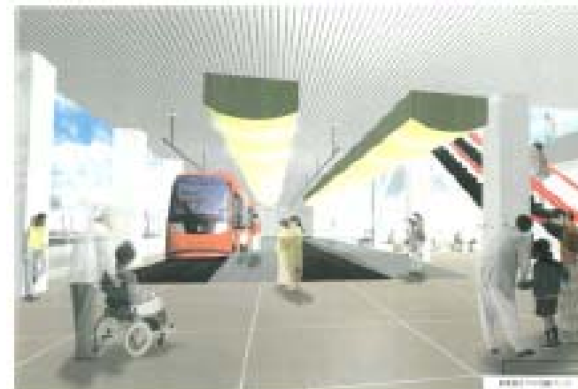
Rendering of Reformed Station with Extension of Manyo Line