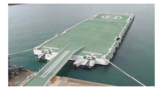
Stockpiling for Emergency