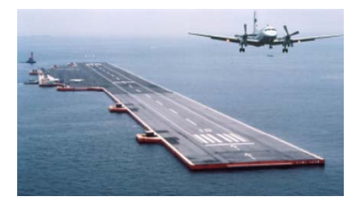
Airport Demonstration Model