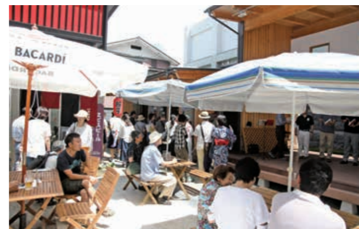
Open terrace at the center of the alleyway