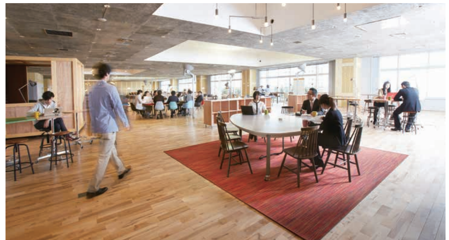
KOIL Park co-working space