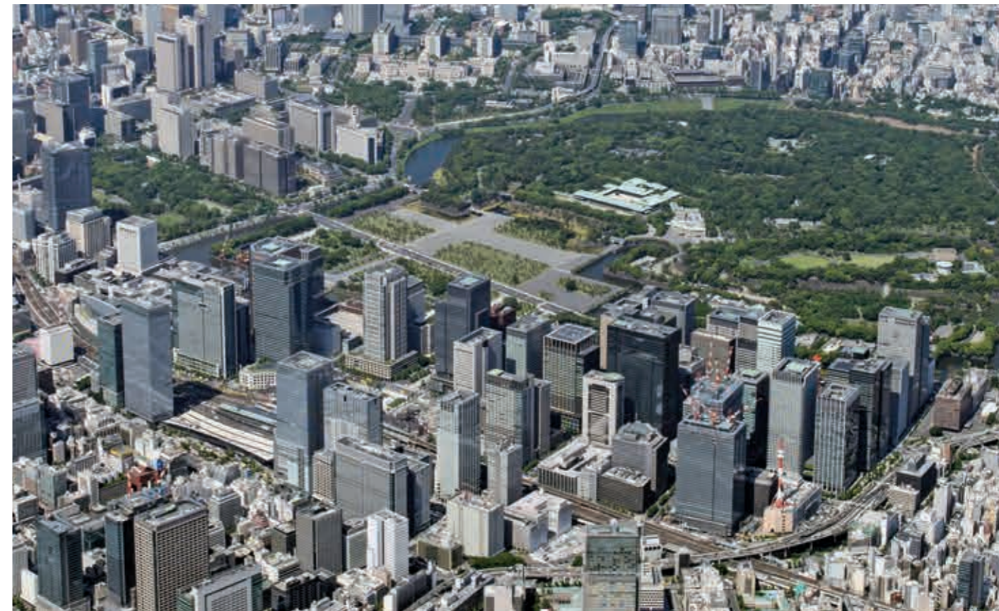
The office district between Tokyo Station and the Imperial Palace