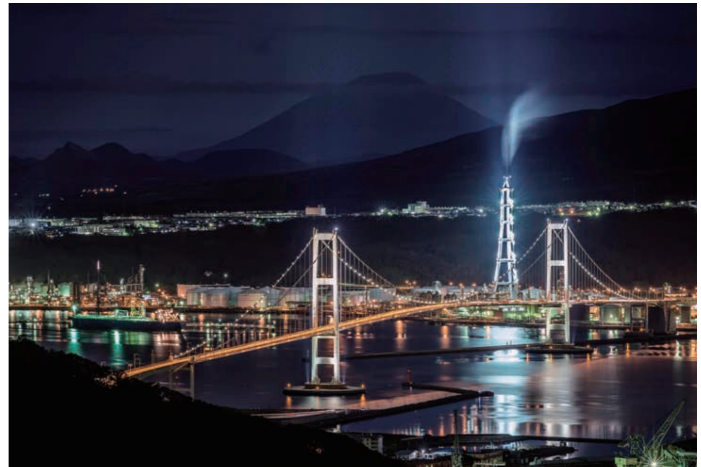
Illumination of Hakucho Bridge uses wind-powered LED lights

has added wind and solar generation to public facilities, created a biogas generation facility at a wastewater treatment plant in cooperation with a private company, and is planning to start one of the largest biomass power generation plants in Japan in 2020. In addition, to promote energy conservation, the city has pursued the conversion of streetlights to LEDs, starting with the illumination of the Hakucho Bridge, which is a central element of the nighttime industrial scenery popular with tourists. The city also provides support to families to jointly adopt fuel cells, solar power generation, home energy management systems, and LED lighting.”