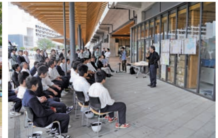
Town planning class for high school students