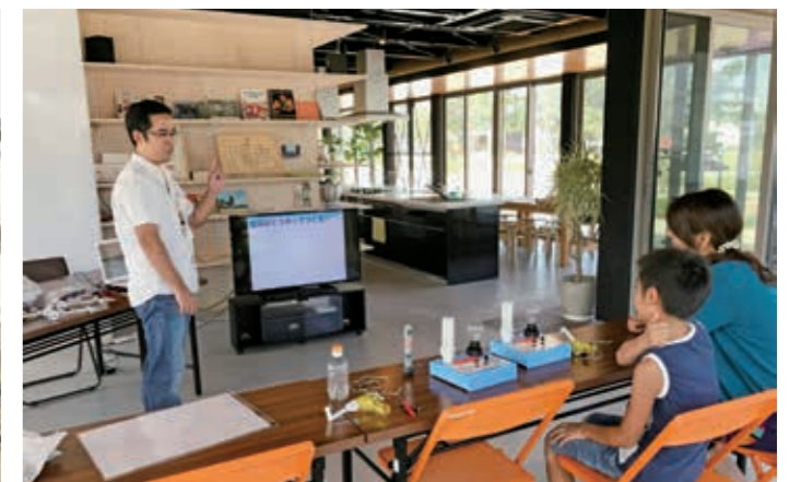
Environmental learning event