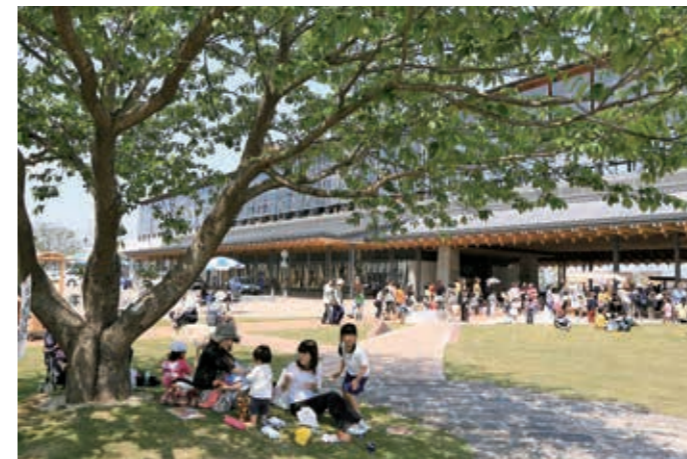
The park has become a place for local residents to relax