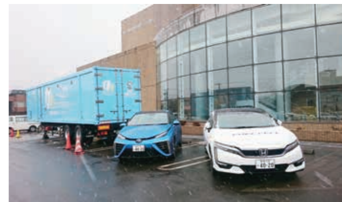
Mobile hydrogen station and fuel cell vehicles