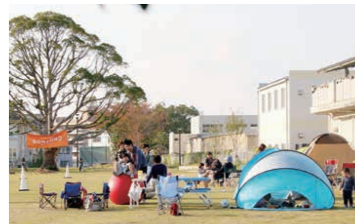
Camping event at a local park