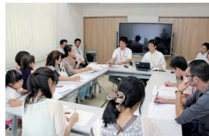
Neighborhood management association