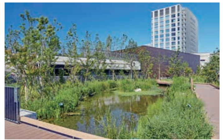
Green Roof is a part of focus on nature