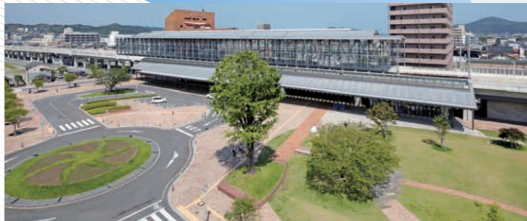
Compact city planning focused on the station and plaza area