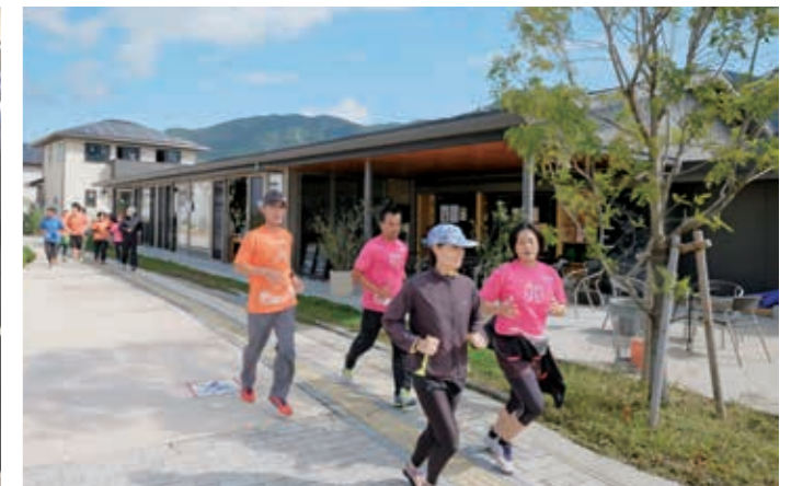
Life Workshop community center