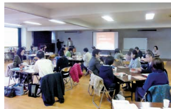
Startup camp to train business owners