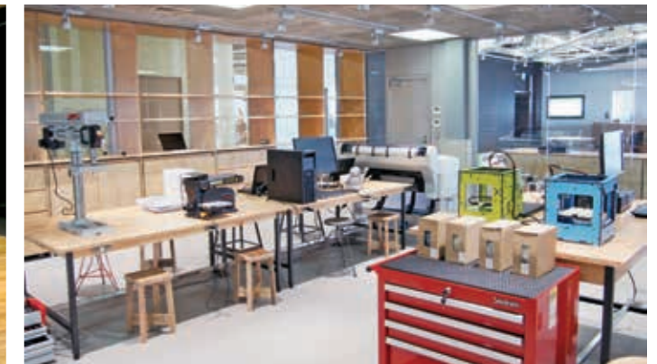
KOIL Factory digital manufacturing workshop