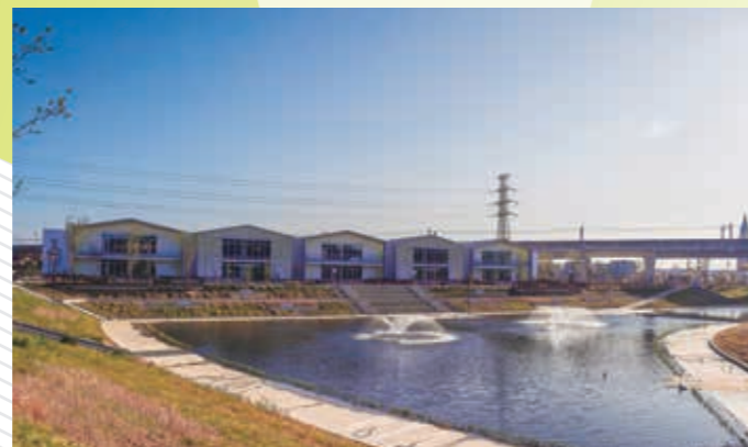
Retention basin integrated into park space