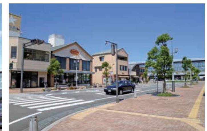
Private development, including apartments, followed the reconstruction of the station and plaza