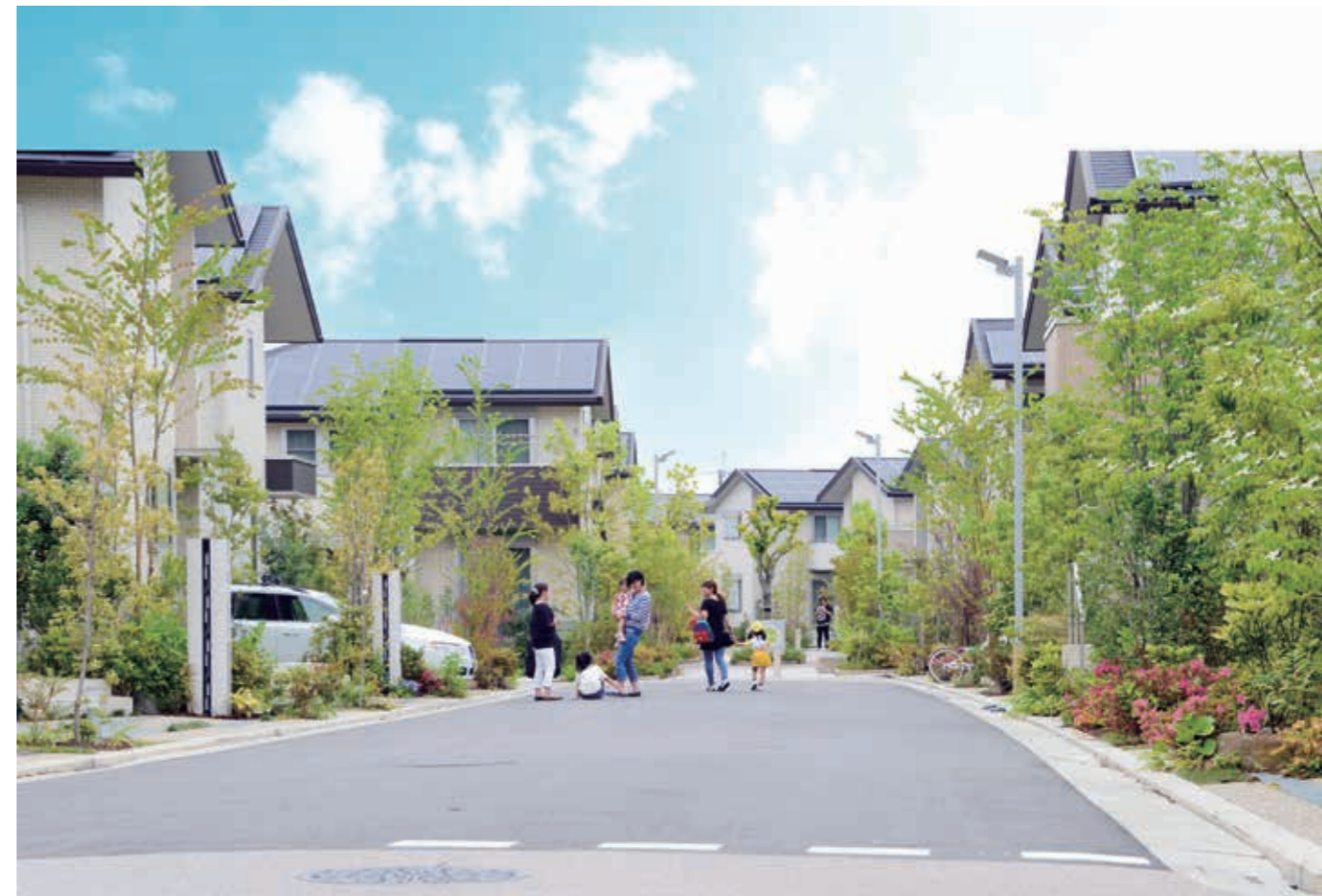
Typical street in the development