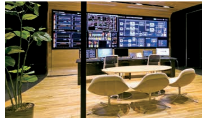
Energy management system