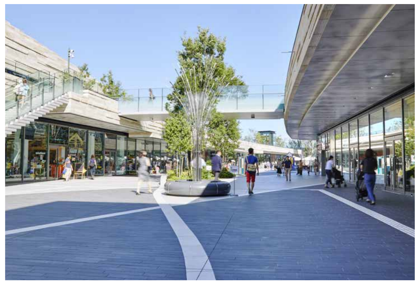
Ribbon Street walking path