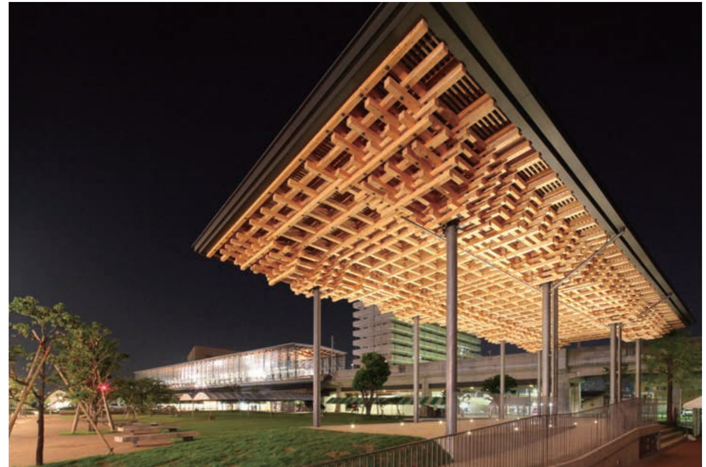
The outdoor stage is built from plentiful local cedar