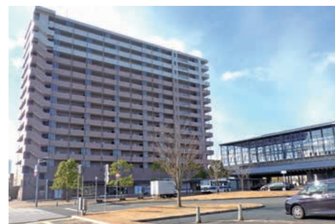
New retail stores facing the street revitalized the area