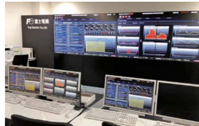
The district's community energy management system