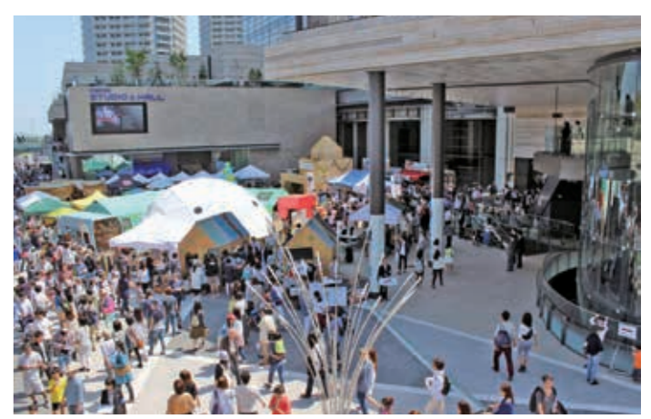
Public spaces host diverse events