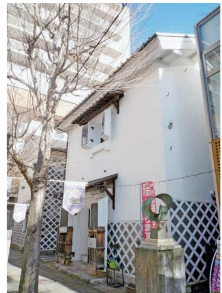
Renovated warehouse is used as management company office