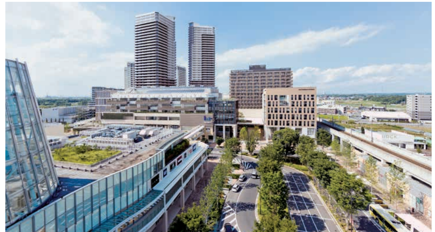
The Gate Square commercial center and residential buildings at the center of the district