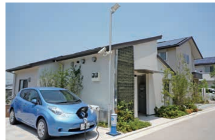
Shared electric vehicle