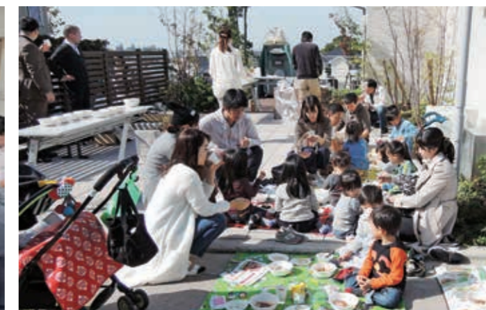
Disaster preparedness event