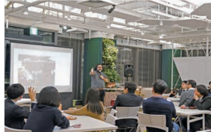
Seminar & event facility