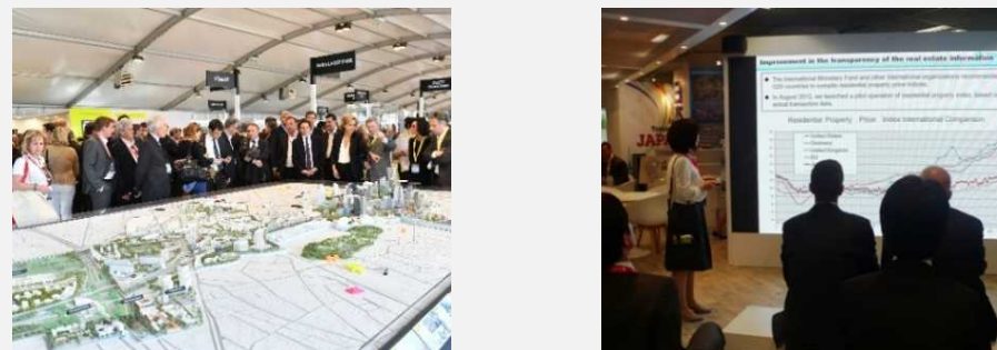
上：MIPIM 2015 メインエントランス 下：MIPIM 2017 会場内の様子