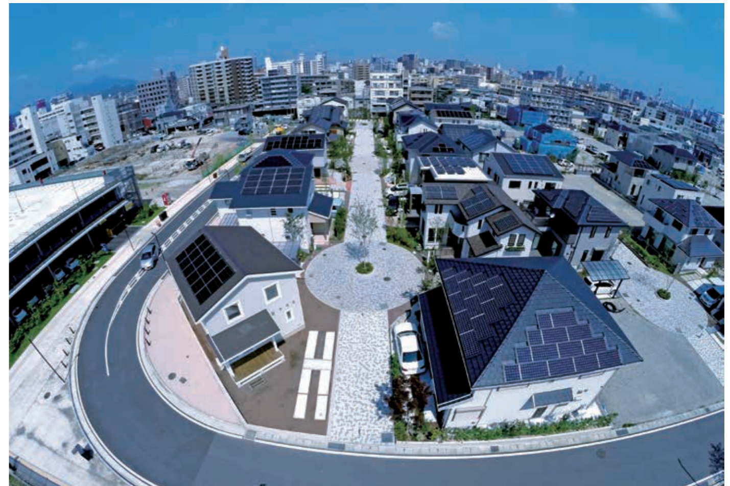
Solar panels installed on houses