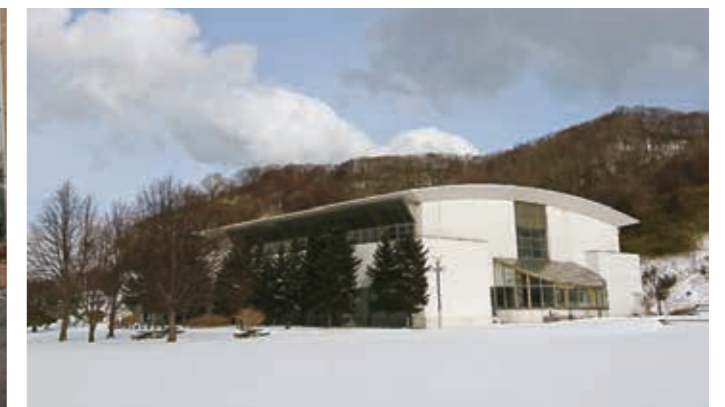
Municipal swimming pool equipped with household fuel cells