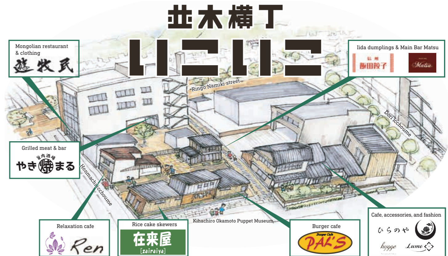
The entire alleyway