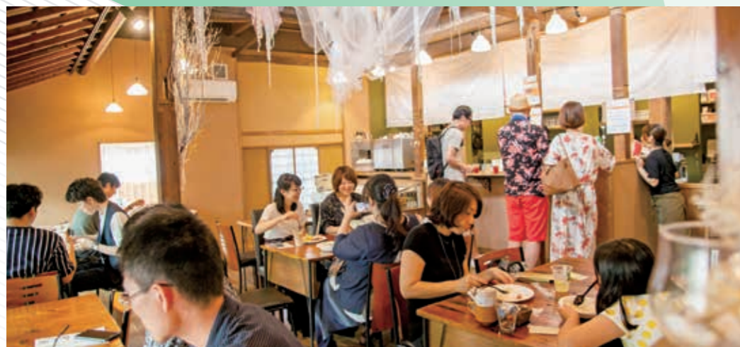
Café located in an old wooden building

This project aims to create a comfortable environment in which people can wander freely between the newly developed establishments, all of which serve food or drinks.