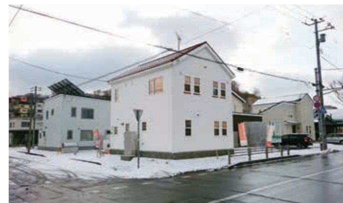
Residential area with fuel cell-equipped homes