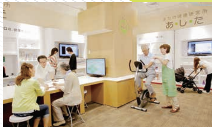
“To-mor-row” health support center