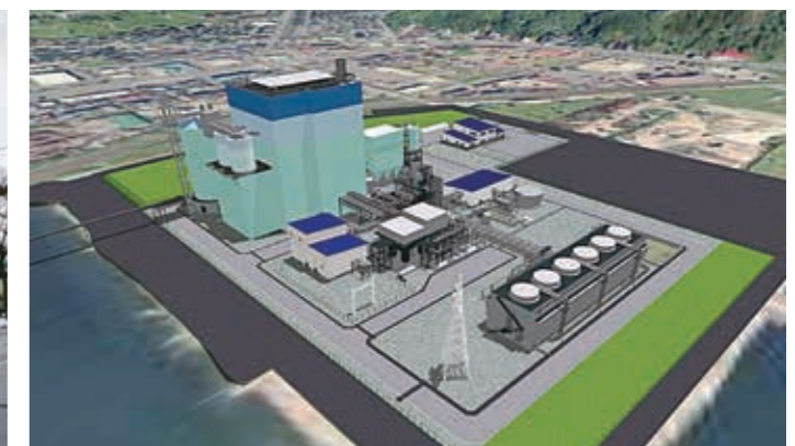
Biomass power generation plant fueled by palm kernel shells is planned to start operation in 2020