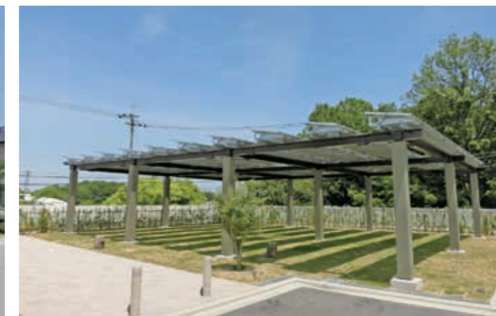
Solar energy system on shared facility