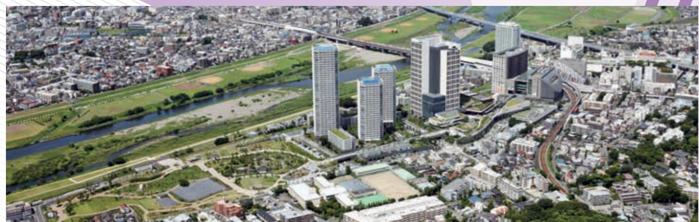
The entire district

In addition, the Futako Tamagawa Rise Council is engaged in town management activities, including hosting participatory events for neighborhood children that make use of the site's natural environment. The successful creation of a lively area and local brand has also led to more events hosted in conjunction with outside companies.