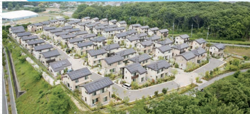
The entire district

Sale of solar electricity and electric car sharing provides the management organization with additional income to sustain its activities besides the management fees collected from residents.