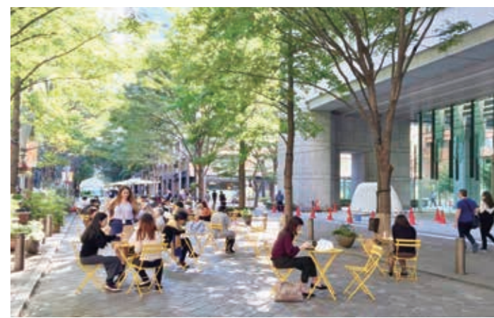
Urban Terrace pedestrian space on closed street