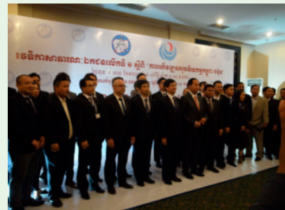
Government officials from the two countries who attended the meeting