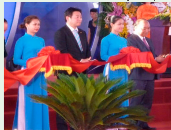
State Minister Akimoto at the ribbon cutting ceremony