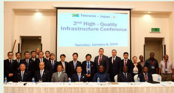
Opening ceremony of the Japan-Turkey Disaster Prevention Seminar

In Kenya, top sales were conducted for road and bridge projects in the vicinity of Mombasa Port through a meeting with Kenya Deputy Minister of Transport, Infrastructure, Housing and Urban Development and Public Works Obure. In addition, an infrastructure seminar was held between Kenyan and Turkish companies interested in infrastructure development projects and Japanese companies, at which there was an active exchange of information and building of relationships through business matching opportunities.