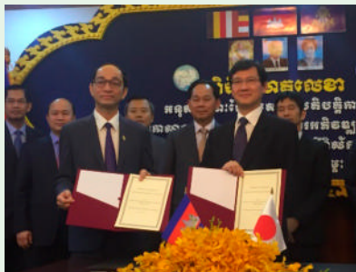
Conclusion of the memorandum