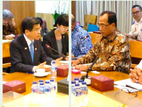
Meeting with Minister of Transportation Budi

In addition, in Indonesia, a meeting was held with Minister of Transportation Budi and Minister of Public Works and Public Housing Ir. Mochamad Basuki Hadimoljono, at which there were discussions toward the restoration and recovery from the earthquake and tsunami that had occurred in Indonesia, the confirmation of the situation and resolution of issues concerning cooperative projects between the countries in the railway, port, and road fields, as well as an agreement to continue to promote cooperation.