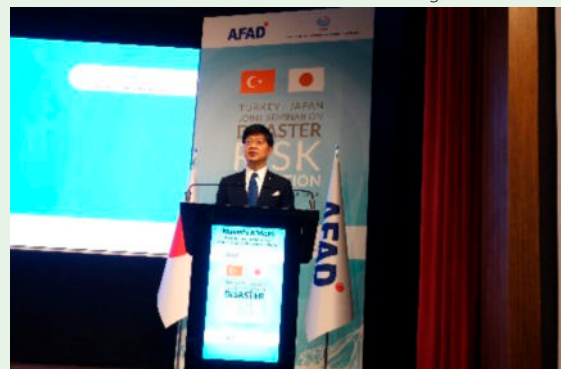
Public-Private Infrastructure Meeting

The Japan-Turkey Disaster Prevention Seminar, which was held jointly by both countries' national governments, was attended by 245 government officials and private companies of both countries that are engaged in the disaster prevention field. At the opening