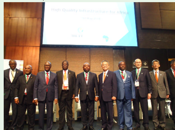
The Japan-Africa Public-Private Economic Forum