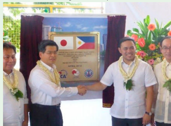
Meeting with Secretary Villar

In Philippines, he held meetings with Secretary of Transport Arthur Tugade and Secretary of Public Works and Highways Mark Villar. During the meetings, broad exchanges of opinions were held concerning cooperation in railway projects such as for the Metro Manila Subway and the North-South Commuter Railway, road projects such as for the Manila Ring Road No. 3 road construction projects, and underground drainage projects, such as for the Parañaque underground drainage route project. After the meeting with Public Works and Highways Secretary Villar, a Memorandum on Technical Cooperation for the Development of Social Capital was executed with the Department of Public Works and Highways, and it was confirmed that in the future, further enhancements will be made to the cooperative relationship between the countries based