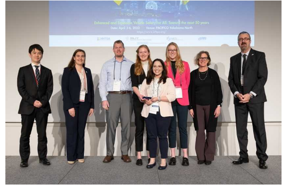
Second-place team from Oregon State University and conference organizers