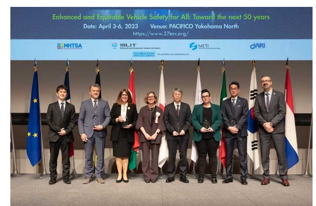
Special Awards of Appreciation