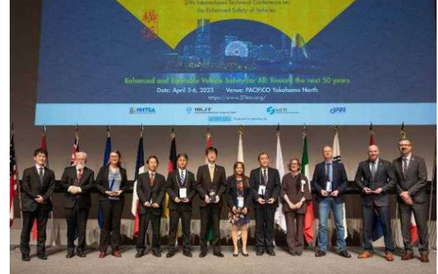
Awards for Safety Engineering Excellence