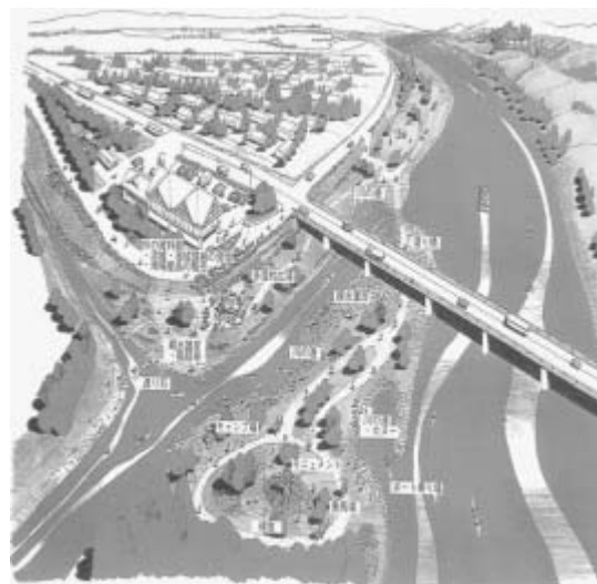
137. (Image of waterfront plaza)