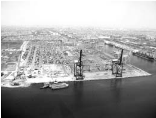
143. (JICA development survey in Indonesia, “ Port of Greater Jakarta Development Plan Survey ”)