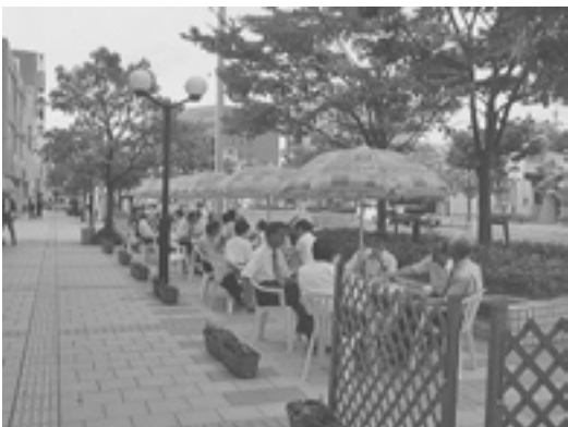
Open café on the pavement