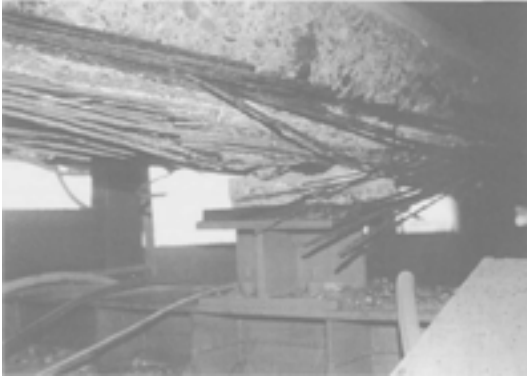
Rupture of PC tendon in a main girder caused by salt damage