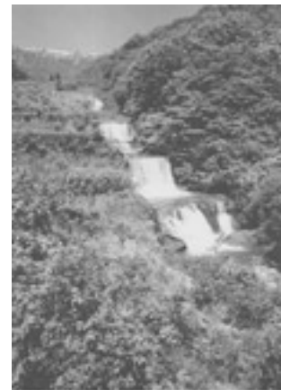
Bannai River Sabo Dam, registered as a designated tangible cultural property (Niigata Prefecture)