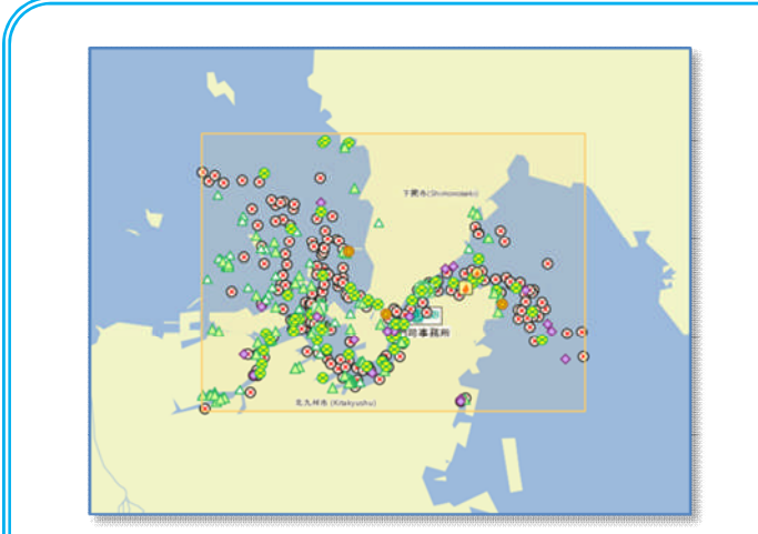
Search function is available in any