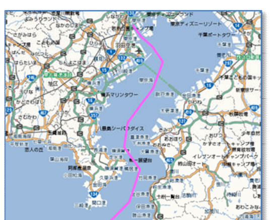
You can draw planned routes