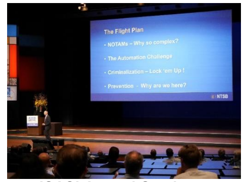
ISASI Annual Seminar (Netherlands)

ISASI holds annual seminar each year, and Japan has participated in each one of them since the establishment of Japan Aircraft Accident Investigation Commission in 1974. In this seminar, working groups including the Flight Recorder Working Group, the Investigator Training and