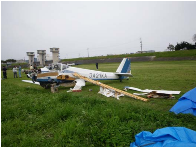
Photo1 (A) Damaged Towing Motor Glider