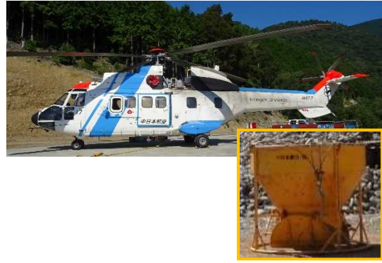
Photo 1 The Aircraft and Bucket of the Serious Incident

This serious incident occurred at approximately 80 m southeast from the Temporary Helipad (N 33° 29' 55", E 134° 05' 27") and at around