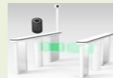
Facilitating Smooth Entry and Exit (Walk-Through Gate)