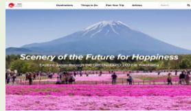
Horticultural Expo Information via JNTO's Dedicated Webpage ※JNTO/Japan National Tourism Organization https://www.jnto.go.jp/