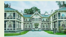
Public Exhibition of Important Cultural Properties (Former Mikasa Hotel)

Note: The above is an illustrative example under the FY2026 budget.