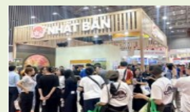
Exhibits at Consumer Travel Expos and Hosting Events for Local Consumers