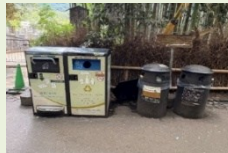
Measures to Prevent Inappropriate Behavior (Smart Waste Bin)