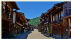
Streetscape Improvement through the Restoration of Historic Assets, Subsurface Installation of Utility Lines, and Beautification