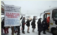
Measures to Reduce Crowding (Park-and-Ride Pilot Program)