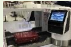
Facilitating Smooth Entry and Exit (Self-Service Bag Drop)