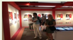
Developing Exhibition Facilities for Culturally Significant Assets Associated with the Local Area