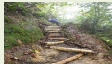
Maintenance and Improvement of Hiking Trails and Related Facilities