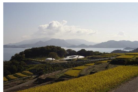
Teshima Art Museum

Contact Us [ Setouchi Triennale Executive Committee Office ] TEL : +81-87-813-0853 | E-MAIL : info@setouchi-artfest.jp Website : https://setouchi-artfest.jp/en/