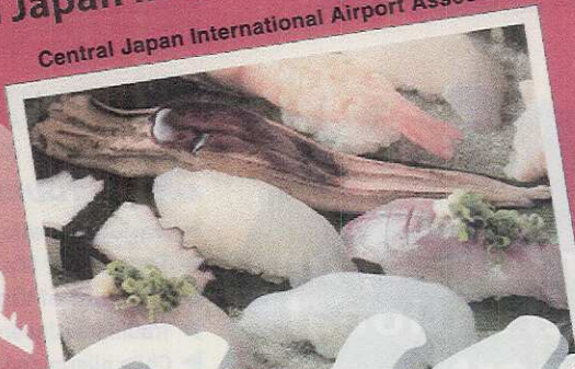
Central Japan International Airport Tours conducted by Central Japan International Airport Association