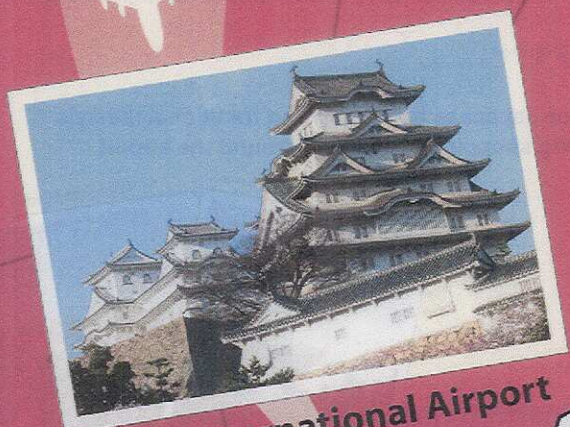
Kansai International Airport Tours conducted by Kansai International Airport Association

If you're in transit or have a stopover at Narita, Kansai or Central Japan International Airports, don't stay in the transit lounge, get out and about! A variety of great value tours have been created to give you the chance to experience traditional Japanese culture, sample delicious Japanese cuisine, bathe in a natural hot spring, visit a car manufacturing plant and much more!