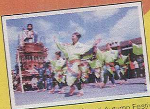
Sawara "Little Edo" Grand Autumn Festival

Oct. 1, 2005 - Dec. 28, 2005 Jan. 20, 2006 - Feb. 20, 2006