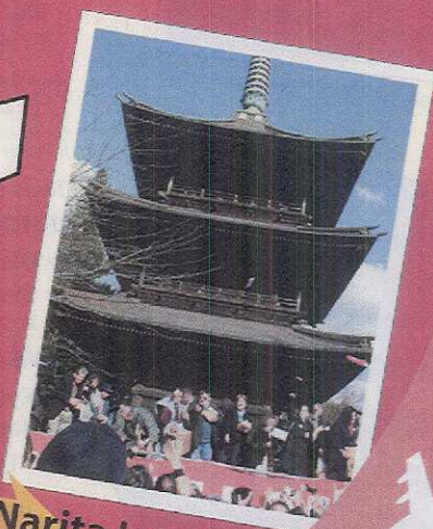
Narita International Airport Tours conducted by Narita International Airport Association