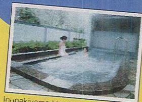
Inunakiyama Hot Spring