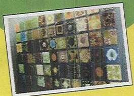
INAX Tile Museum

Sep. 26, 2005 - Mar. 3, 2006 (Dec. 23, 2005 - Jan. 6, 2006 excluded)