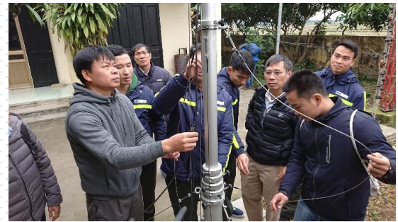
Technical training for local engineers