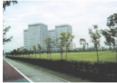
General View of the Third Government Office Building in Taejon Metropolitan