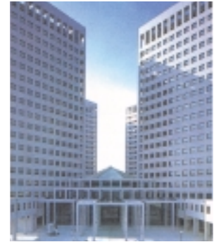
Front View of the Third Government Office Building in Taejon Metropolitan