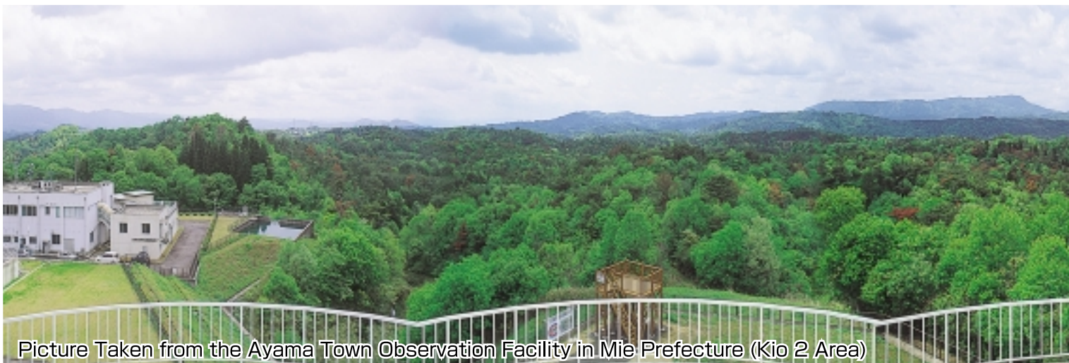
Picture Taken from the Ayama Town Observation Facility in Mie Prefecture (Kio 2 Area)

Coexist with an Environment Supported by Diverse Functions.