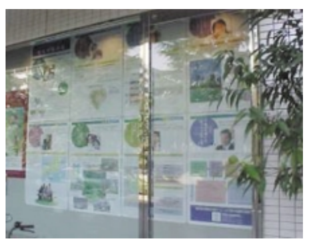
Allec City "Oyakata" Show Window in Fukui Prefecture

Posters are also being displayed at various places, such as major railroad stations and freeway service areas, throughout the country.