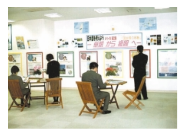
In Ayabe Chamber of Commerce and Industry in Kyoto Prefecture