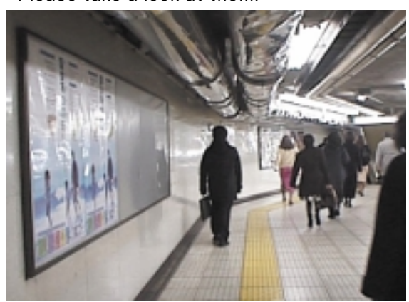
Kasumigaseki Station of the Subway in Tokyo