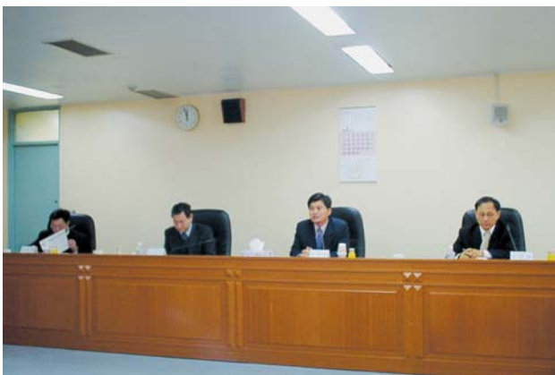
Representative of the Administrative Capital Relocation Project Team of Korea

The visiting party interviewed the Project Team, concerning topics such as how the Parliament passed the Special Act for the Construction of the New Administrative Capital and the work schedule up to selecting a site for the New Administrative Capital, which will be determined by the end of this year.