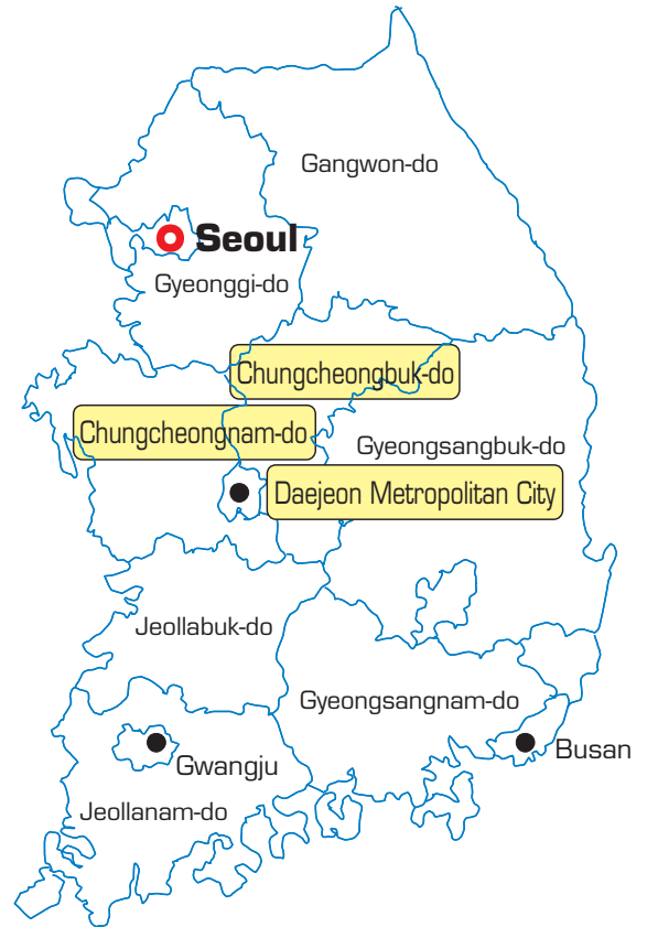
Location of the Chungcheong area (Chungcheongbuk-do, Chungcheongnam-do, and Daejeon Metropolitan City)