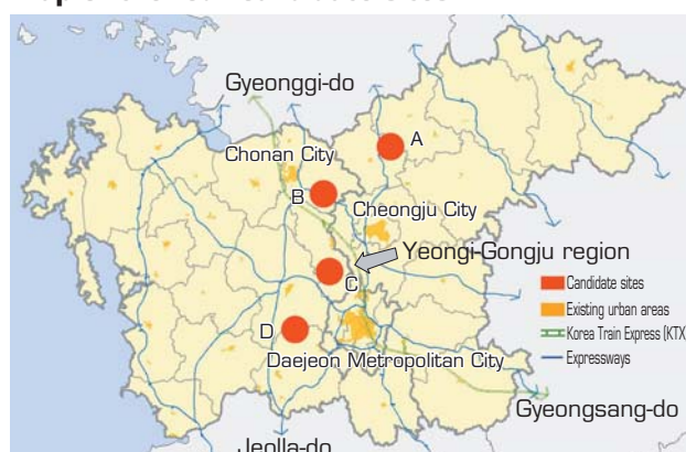
Map of the four candidate sites

The Yeongi-Gongju region is located approximately 160km south of Seoul.