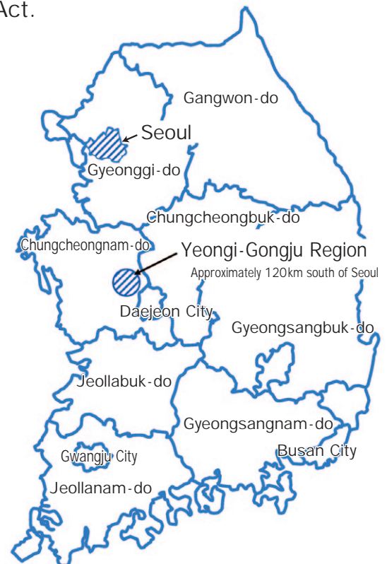
The simplified map only shows basic geographical relationships and is not completely accurate.

Agencies to stay in Seoul include Cheong Wa Dae (Office of the President), the Parliament, Supreme Court, Ministry of Unification, Ministry of Foreign Affairs and Trade, Ministry of National Defense, Ministry of Justice, Ministry of Government Administration and Home Affairs, and Ministry of Gender Equality.