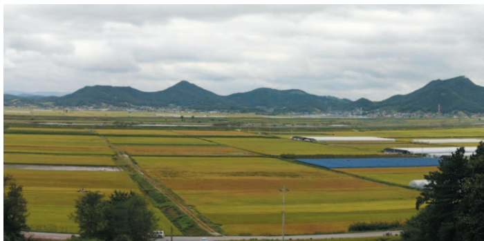
The planned construction site for the New Multi-functional Administrative City

In Korea, a draft for the master plan of the New Multi-functional Administrative City was announced in May, 2006. According to the draft, the new city will have a ring-like structure with an open central space of approximately three square kilometers, which will be surrounded by government agency buildings and residential areas. The new city will have over twenty communities, each of them with a population of twenty to thirty thousand. People will live in low-rise residential buildings with a population density of approximately 300 people per hectare. After the master plan is formally decided, the construction of the new city will start in FY 2007, and the relocation of administrative agencies will start by 2012.