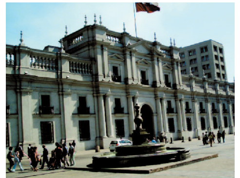
Presidential Palace (La Moneda Palace)