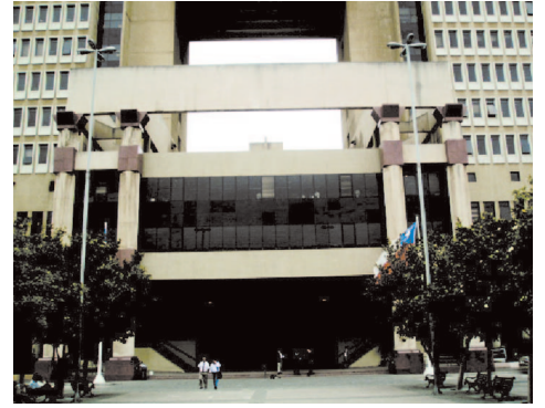
The present Congress building in Valparaiso

Every Monday, Congress members work in Santiago, and many of them have their private offices in Santiago. Political parties' head offices are also located in Santiago, providing bases for Congress members' activities.