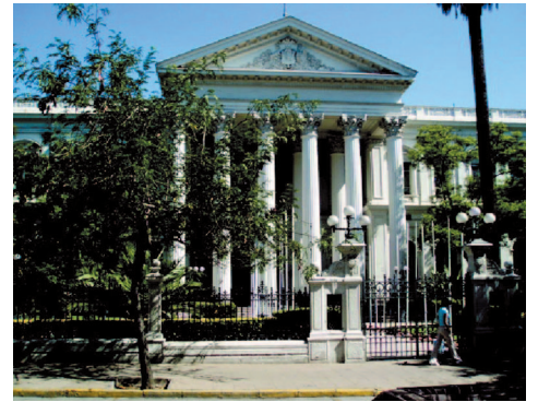
The former Congress building in Santiago