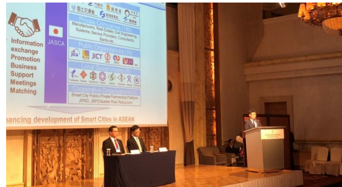
Presentation of JASCA