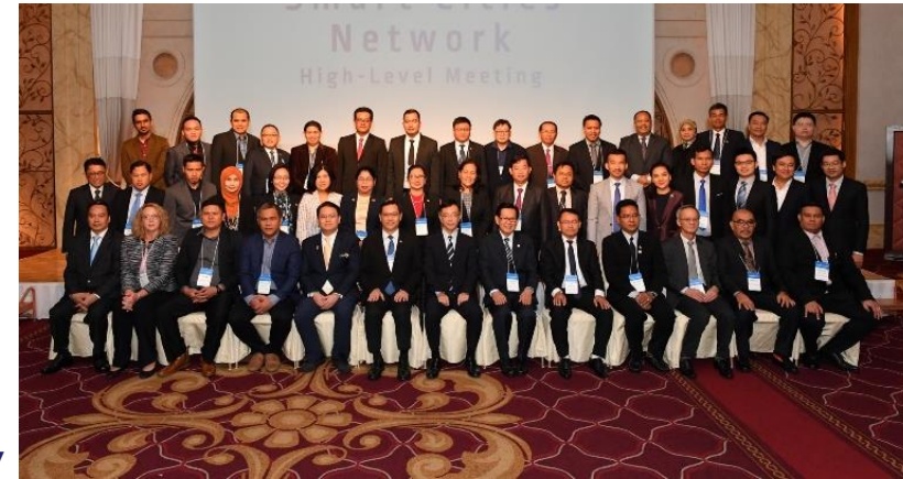
Guests from ASEAN and ASCN

Ministries of ASEAN Member States and Japan, Chief Smart City Officers from ASCN Pilot Cities, Japanese Cities, ASEAN Secretariat and other Organizations, ASEAN and Japanese private sectors, etc.