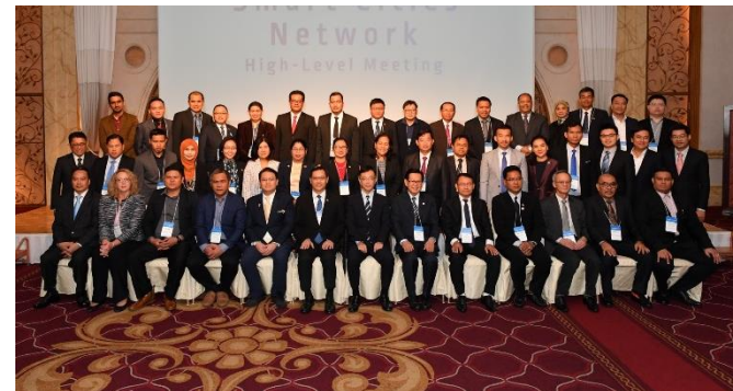
Guests from ASEAN and ASCN