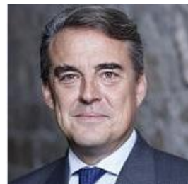
Alexandre De Juniac

MP, Chair Global Network for Road Safety Legislators, United Kingdom