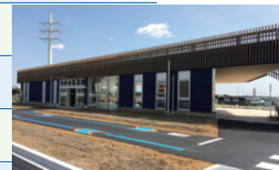
Facilities for Cyclists (Gateway)