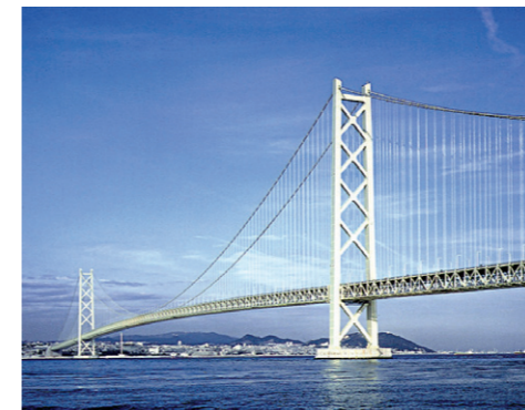
Akashi Kaikyo Bridge

Onomichi-Imabari route (the Nishi-Seto Expressway). The total length of these roads is approximately 173km. The center span of the Akashi Kaikyo Bridge is 1,991m, making it the longest in the world. Additionally, the height of the main tower is approximately 300m above sea level.