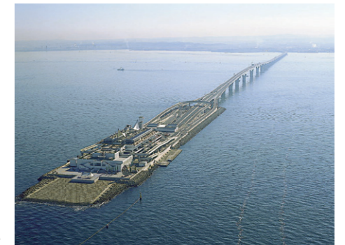
The manmade island "Umihotaru" and the Aqua-line Bridge

The Tokyo Bay Aqua-line Expressway, which allows a motorist to transverse the Tokyo Bay, was completed in 1997. About 10km, out of its total 15.1km, are under the Bay and the remaining 5km are configured as the Aqua Bridge. A ventilation tower ("Kaze-no-to") was constructed in the middle of the tunnel, and a manmade island ("Umihotaru") was constructed where the tunnel and the bridge meet.