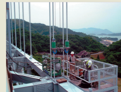
Non-destructive inspection of hangers